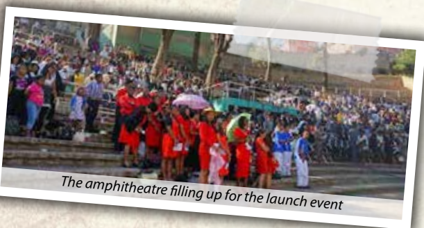
The amphitheatre filling up for the launch event

Malagasy is the common language of all 18 tribes on the island and key to their national identity . It is a literate language — and the Bible has been crucial in preserving it: in 2015 they will celebrate 180 years of the Bible in Malagasy (the oldest mother-tongue translation in Africa!)