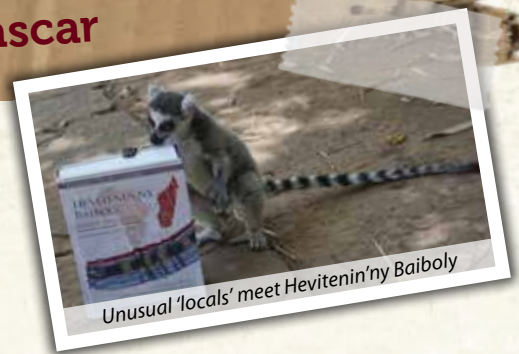
Unusual 'locals' meet Hevitenin'ny Baiboly

complete. This is not just a commentary using Malagasy words, it uses Malagasy meanings!