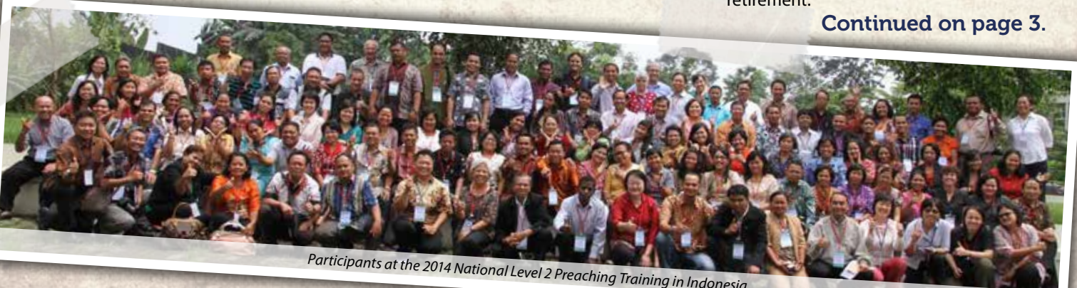
Participants at the 2014 National Level 2 Preaching Training in Indonesia