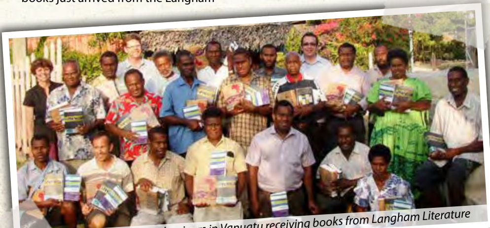
Langham Preaching local trainers in Vanuatu receiving books from Langham Literature

Almost Measureless your impact on the church of the Majority World when you pray, support and donate to Langham Partnership