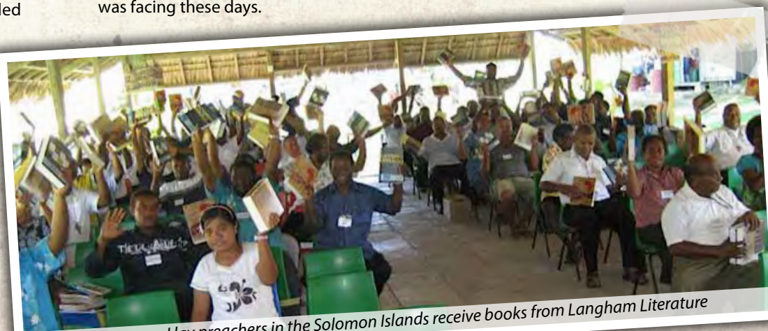
Pastors and lay preachers in the Solomon Islands receive books from Langham Literature

These kind words of Acher's are echoed through many more messages that we receive. Principals in Latin America, librarians in Malawi, grateful seminaries in Myanmar who have struggled to receive good biblical materials for decades, all greatly appreciate the resources that they receive from Langham . As a ministry we are greatly encouraged and extend grateful thanks to all of you that have supported — and continue to support — our vision.