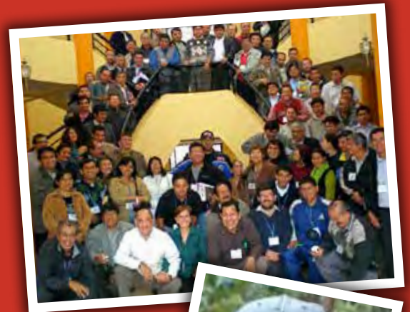
Participants in a Langham Preaching Seminar, Latin America